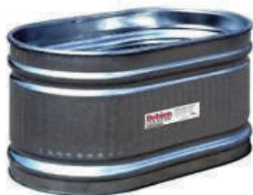
Beverage Troughs starting at $25.00

Call to Place Your Order 608.755.4123 x399