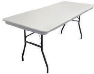
6' or 8' Banquet Tables | $7.50