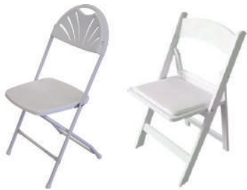
Chairs | starting at $2.25