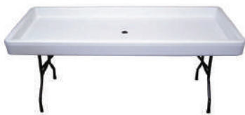
Fill & Chill Table | $45.00