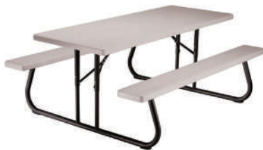
Folding Picnic Tables | $25.00