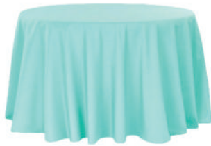
Linens | starting at $6.95