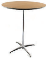
Cocktail Tables | $11.50