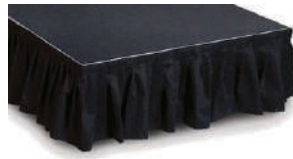
Black Stage Skirting

Each leg adjusts independently from 16" in height to 28" in height.