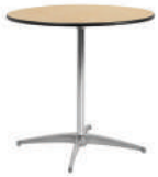
Sit Down Bistro Tables 36" Top | Seats 4 | $14.50