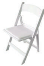
White Folding Resin Chair with Padded Seat $4.50