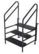
Three Step Staircase with Handrail