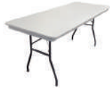
Folding Banquet Tables 6' x 30" | Seats 6 | $11.50 8' x 30" | Seats 8 | $11.50