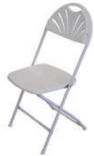
Seashell White Folding Metal Chair $3.50