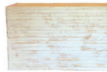
White Wash Bar $150.00