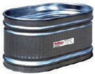
Beverage Troughs Available in 3ft, 6ft, and 8ft sizes $30.00