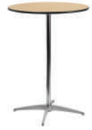
Stand Up Cocktail Tables 30" Top | $14.50