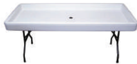
Fill & Chill Table (includes plug) 4' x 30" | $45.00 6' x 30" | $45.00