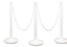
White Plastic Stanchion Post