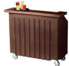
Rolling Port-A-Bar Collapsible, includes a built in ice well $95.00