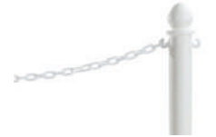
10' Plastic Chain