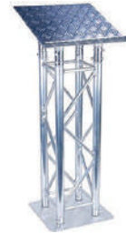
Diamond Plate Podium