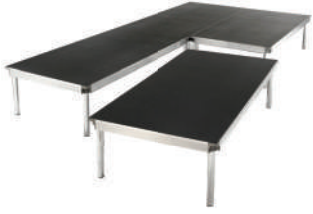
4' x 8' Sections