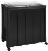
Flip Top Cooler on Wheels $55.00