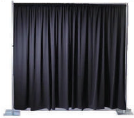
8 Foot Tall Pipe and Drape | $3.50 per linear foot

Expandable cross bar: 6 Feet, 8 Feet or 10 Feet