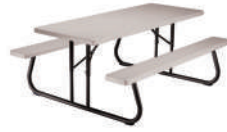
Plastic Folding Picnic Tables 6' | Seats 8 | $25.00